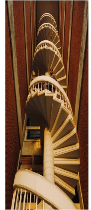
A security guard keeping watch of the academic area from the spiral staircase of the Faculty building, 2007